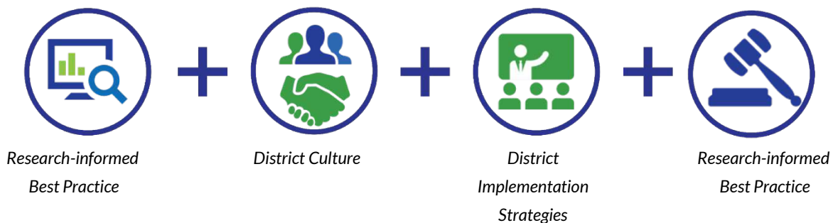
Figure 1: Successful Implementation Factors

Outside of statewide requirements, districts have a great deal of flexibility in determining appropriate EE System policy. DPI recommends that districts consider a combination of factors for successful implementation, including research-informed best practice (as described in the DPI EE User Guides ), district culture, implementation strategies that match district needs, and advice from the district’s legal counsel.